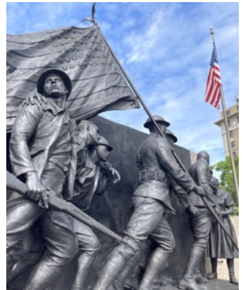
World War I Memorial, Washington, DC